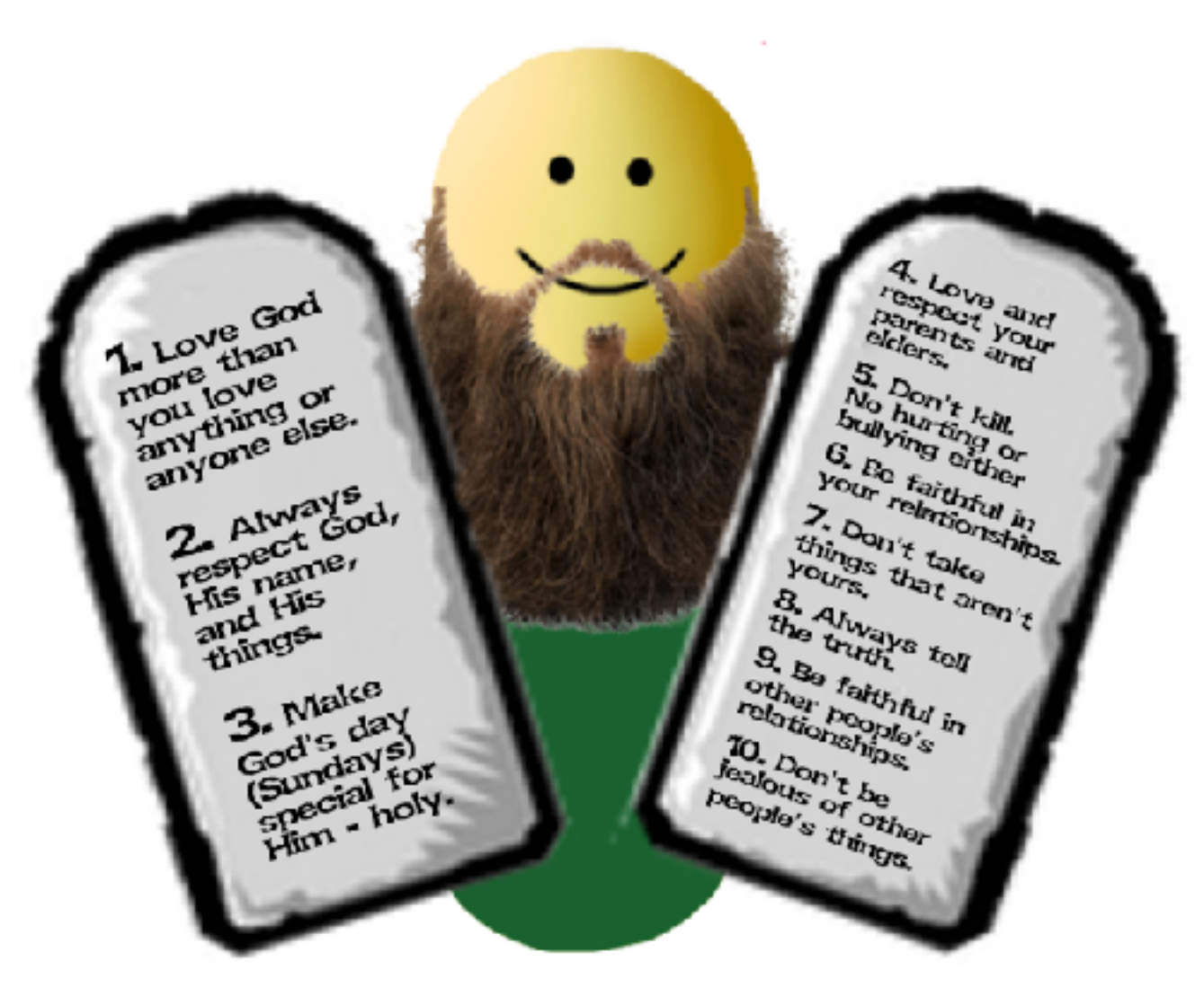
Simplified for kids.