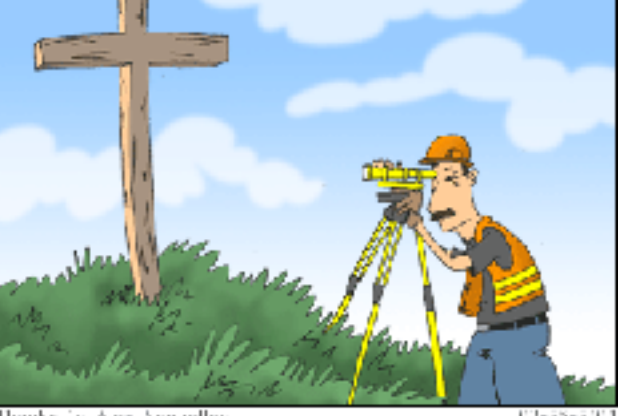
EVERYBODY ELSE MERELY TALK'S ABOUT SURVEYING THE WONDROUS CROSS ... HE ACTUALLY DID IT