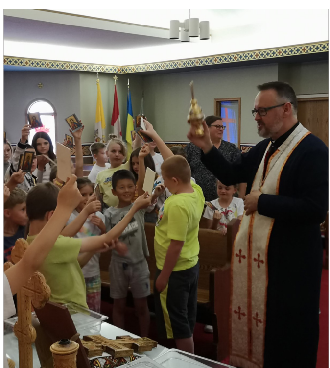
independence and excitement for the day ahead.