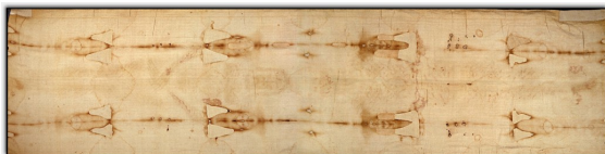
The Shroud of Turin Solemn Exposition of an Official Replica Authorized by the Archdiocese of Turin, Italy Come and See!