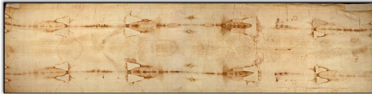
The Shroud of Turin Solemn Exposition of an Official Replica Authorized by the Archdiocese of Turin, Italy Come and See!

CONTACT: Eduard Hecker, Presenter, 780-483-4707 or e_hecker@telus.net or the parish website: www.stjosaphat.ab.ca