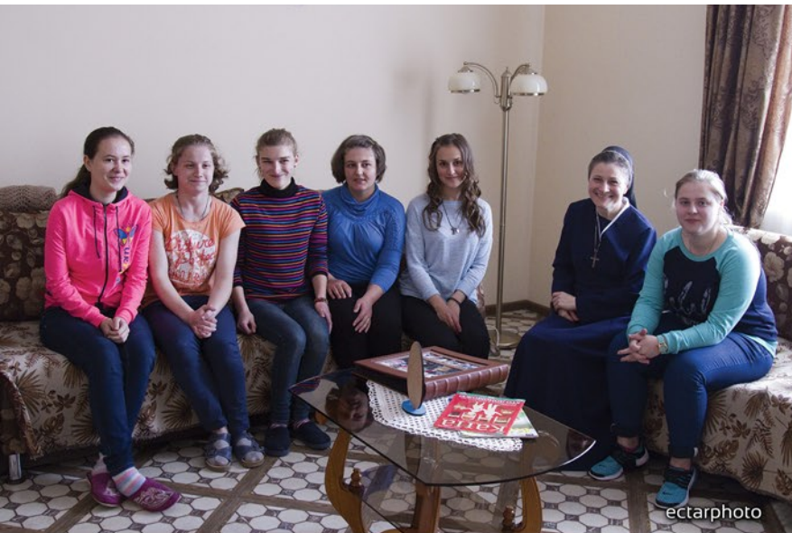
▲ At the House of Hope the girls are welcomed and feel safe