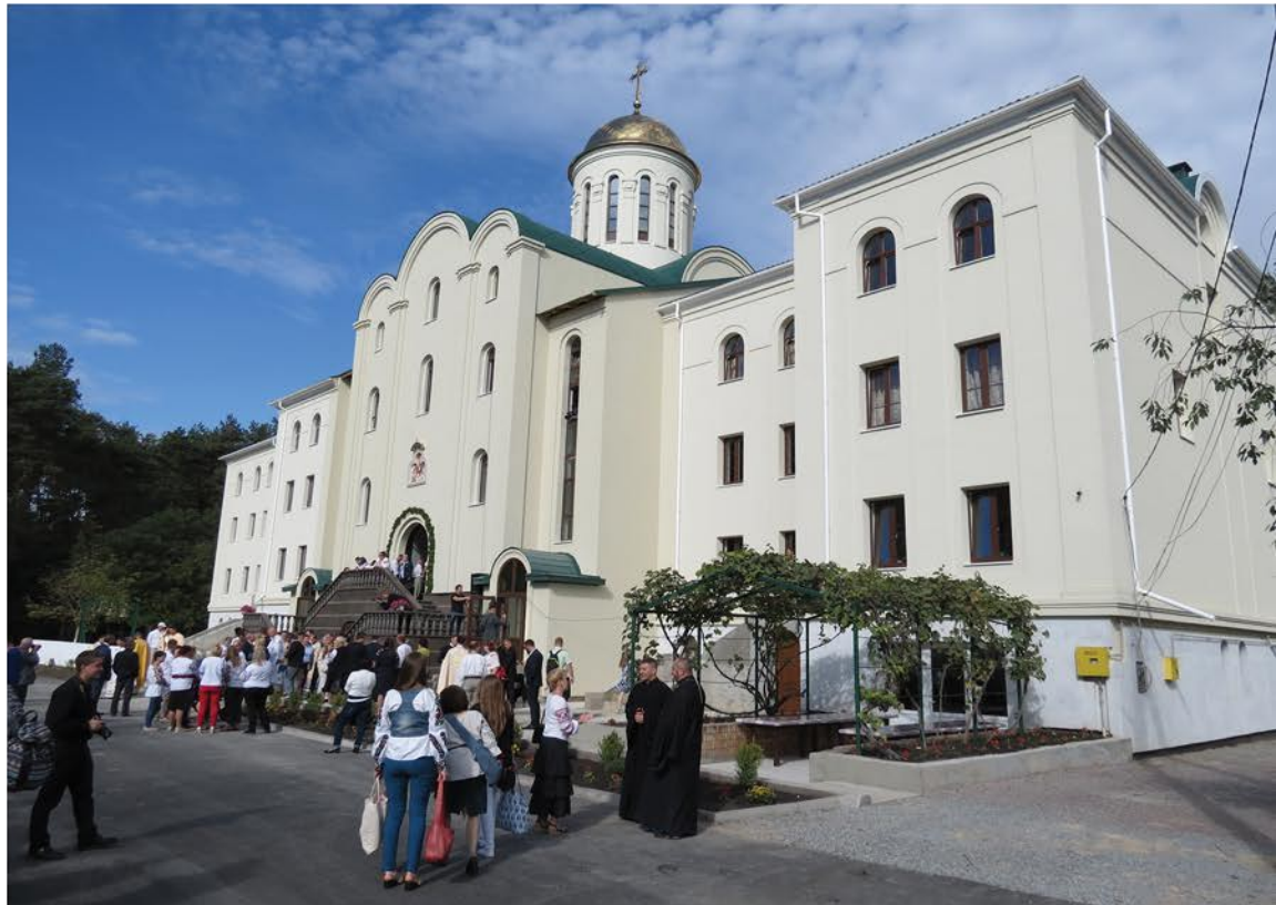
▲ Consecration of the Three Holy Hierarchs Seminary. September 2017, village of Kniazhychi, near Kyiv

The seminary is a higher educational institution of the Ukrainian [Greek] Catholic Church blessed by the Archbishop of Kyiv. This seminary has special historic significance as it is the closest to the Eastern part of Ukraine where the church finally started to reestablish itself after decades of Soviet persecution. It is the church's vision that the Three Holy Hierarchs Seminary will form future priests for serving in Eastern Ukraine.