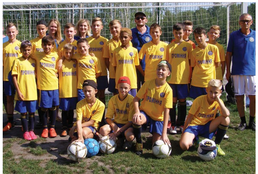
▲ Orphaned boys feel happy playing soccer at the Prominnia Centre

Based on traditional Christian values, Center Prominnia organizes educational and skill-development activities for orphans and the homeless youth of the Zaporizhzhia region. In 2016 around 400 children of different social backgrounds participated in various programs such as sports and handicraft classes where Christian values were taught.