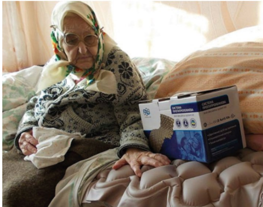
▲ New pressure relief mattress will provide necessary comfort for this immobile old lady.

The libraries allow vulnerable people like the elderly to borrow reliable medical and rehabilitation equipment at the Caritas-Ukraine's Home Care Centres in Lviv, Ivano-Frankivsk and Kharkiv. Medical equipment was lent more than 2,700 times to people who have difficulty moving or are immobile. In 2016-2017 CNEWA also helped the centre to purchase new items (17 mattresses, 4 pillows, 15 toilet chairs, 12 walkers, 8 crutches) and to provide 14,398 consultations and workshops to 1,000 local caregivers.