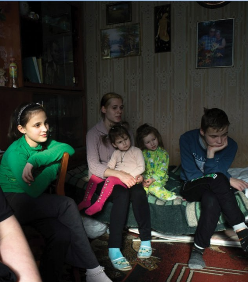
families who fled to Kyiv from war in Eastern Ukraine to survive