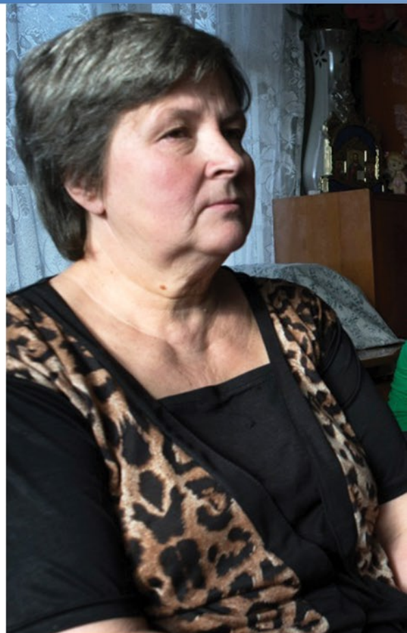
Food and basic necessities helped displaced

CNEWA supported a new program offered by the Ukrainian Catholic University to train four young Ukrainian Catholic priests in ministry to people in crisis and those living with the post-traumatic stress disorder (PTSD). We also helped these priests to hold two summer camps in 2016 for families traumatized by the war experiences in Eastern Ukraine. The program of the camps included spiritual workshops and recreational components for 140 people .