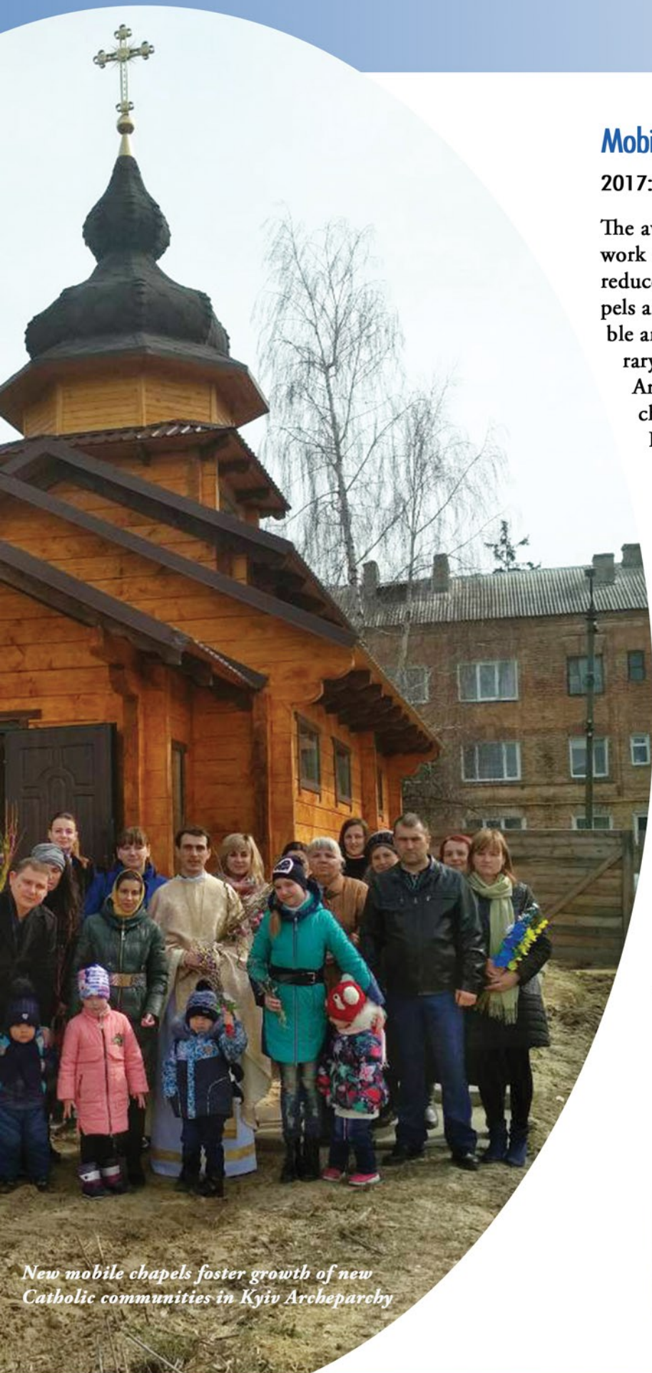
New mobile chapels foster growth of new Catholic communities in Kyiv Archeparchy