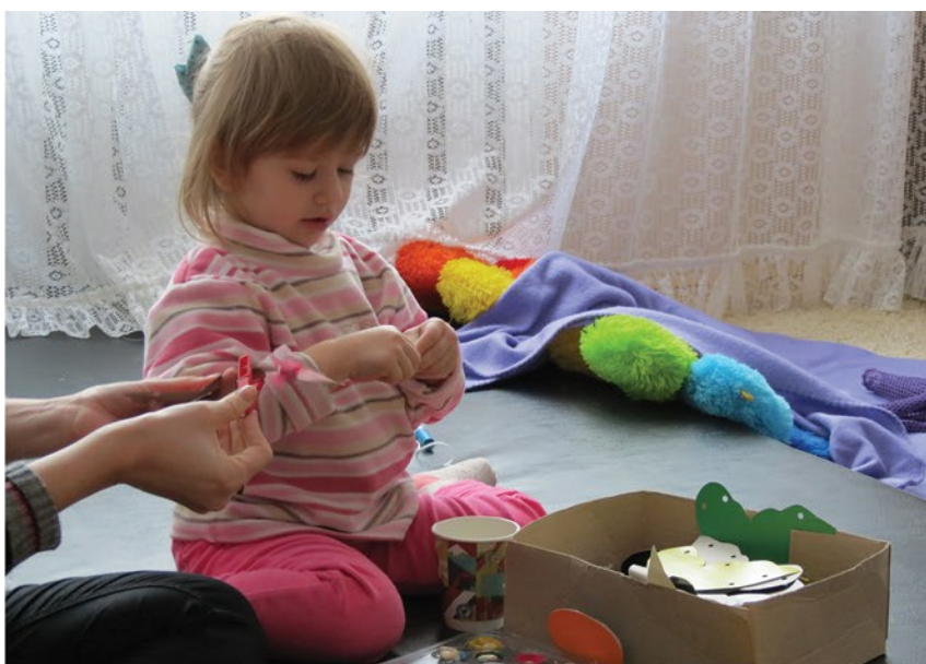
▲ Caritas Kyiv provides special care for children who are traumatized after escaping the war in Eastern Ukraine