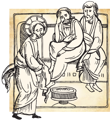
Seventh Day. Thursday